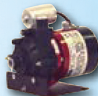
SM 959 Pump