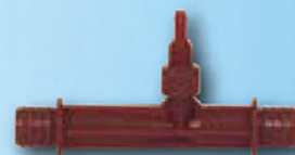
684 Mazzei Injector