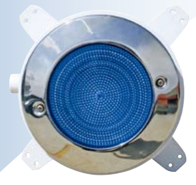
Optional Stainless Steel Rim