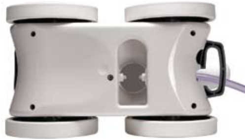
Underside of Legend shows its specially designed debris channel and massive intake throat that removes ultra-small and large debris.