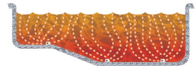
VANQUISH SAVES HEAT ENERGY