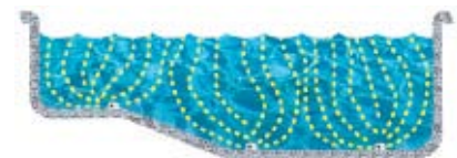
CYCLECLEAN SAVES CHEMICALS