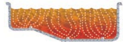
CYCLECLEAN SAVES HEAT ENERGY